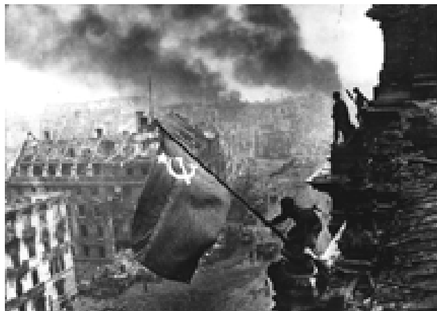
"Raising the Red Flag over the Reichstag," May 2, 1945

During the war, Khaldei documented the declaration of war on June 22, 1941, the Nazi firebombing of Murmansk, battles throughout the south, and the Red Army's path of liberation through Eastern Europe and Germany.