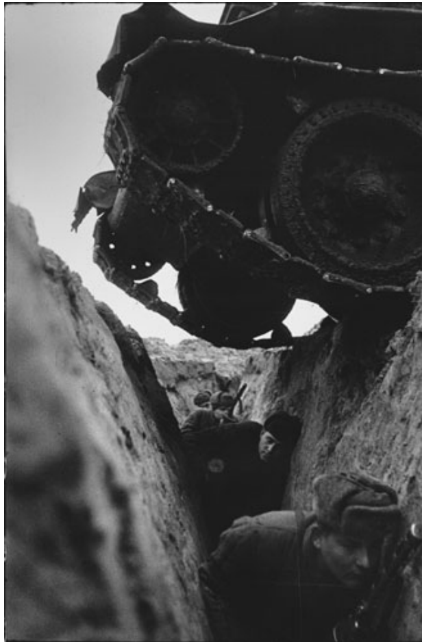
“Kursk Tank Battle,” 1943