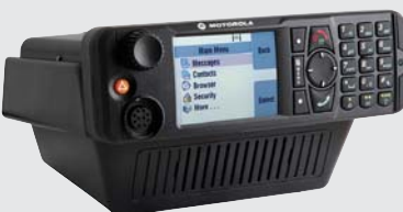
DESK MOUNT CONTROL CENTRE