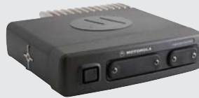
EXPANSION HEAD ENHANCED STD AND AUXILIARY 25 PIN AND RS232