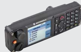
IP67 CONTROL HEAD