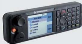
REMOTE CONTROL HEAD