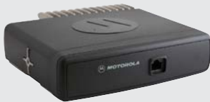
EXPANSION HEAD SINGLE STD CONNECTION