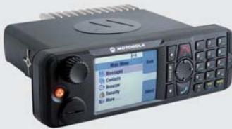
STANDARD CONTROL HEAD