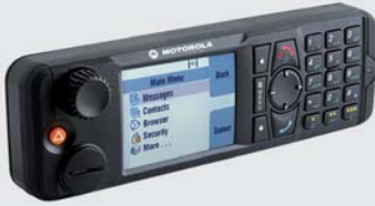
REMOTE ETHERNET CONTROL HEAD (ReCh) SUPPORTS EXTERNAL SPEAKERS AND PTT