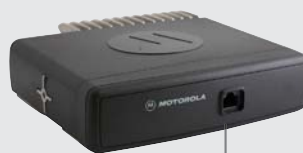
REMOTE HEAD MOUNT CAR, AMBULANCE, FIRE TRUCK