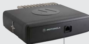
IP67 MOUNT BOAT, MOTORCYCLE