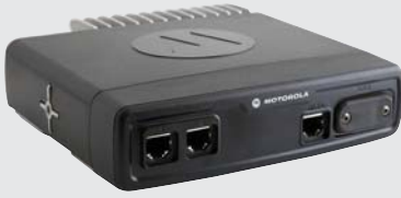
ETHERNET EXPANSION HEAD 2X STD, ETHERNET TYPE, ETHERNET SIM READER AND RS232