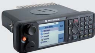
DASH MOUNT CAR, TRUCK