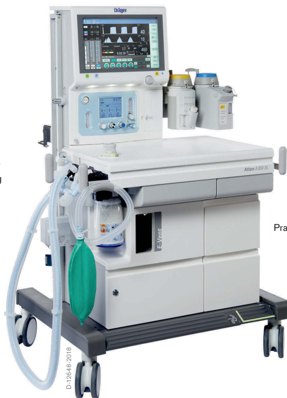
Atlan® A300 XL

Large work surface, lockable drawer and additional shelves (optional) for optimal working conditions and supplies storage