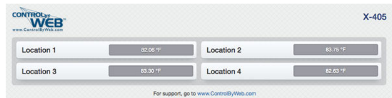
Example Control Page