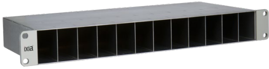
Assembly Rack Chassis – RK-Flex-24