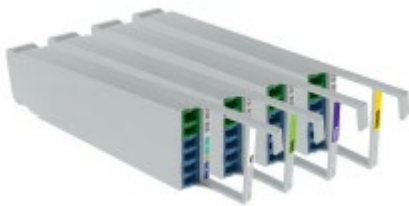
Flex Tap LC