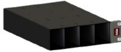
Mini Chassis – RK-Flex-8