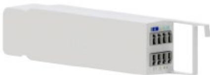
Flex Tap BiDi