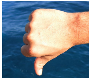
Descend (go down)