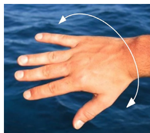
Something is wrong