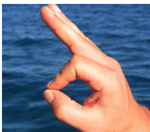
Are you OK? I am OK?