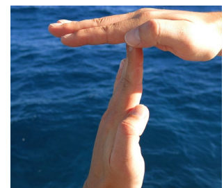
Time to head back