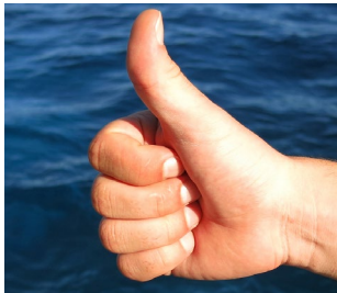
Ascend (go up)

Try to copy each of the dive signs. Scientists working underwater must remember them all. When you are ready try out the dive signs on your partner. Can your partner work out what you are communicating to them? What do they reply?