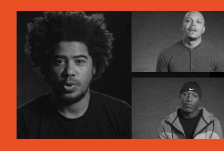
Lulu, I Hear You-a 30 character virtual performance piece based on writings about the pandemic from RTA members is presented.