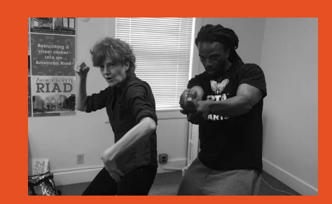
Distance learning activities continue with DVD lessons written, filmed and duplicated.