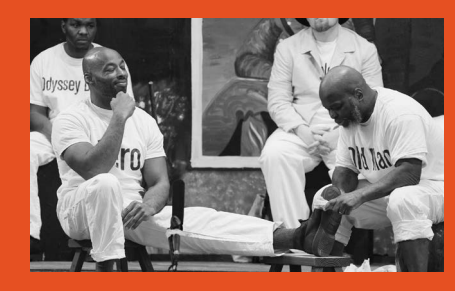
Presented two full-scale theatre productions.