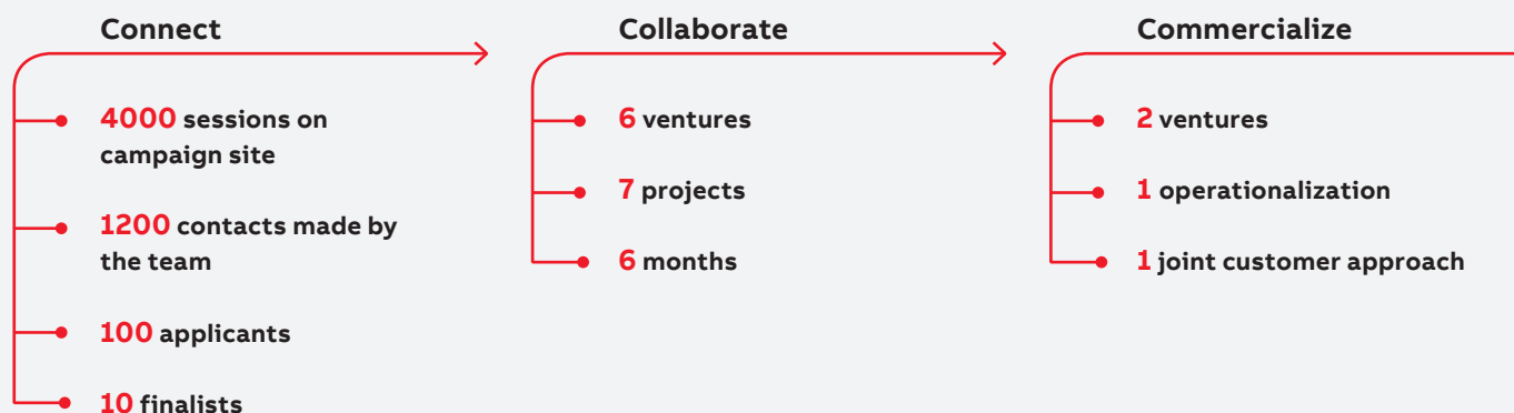
Figure 3. ABB Drives' CCC cohort 2017 in numbers

After all the initial projects in the collaboration program had finished within around six months, ABB continued with two of the ventures to implement them.