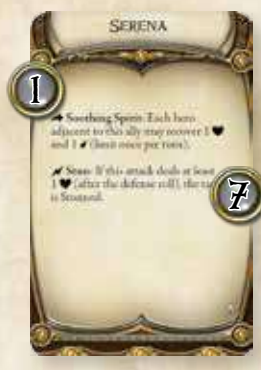
ALLY CARD BACK