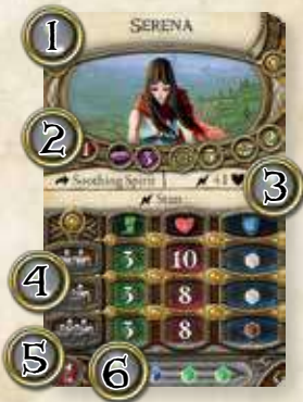
ALLY CARD FRONT