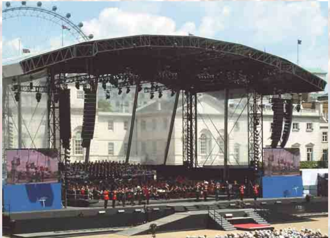
The stage at Horseguards Parade

July 10 saw the culmination of a week-long festival of events, when the Queen was joined by the prime minister and 12,000 others at Horseguards Parade for the World War II 60th