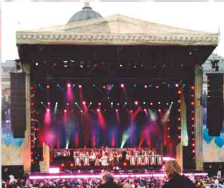
The VE stage at Trafalgar Square

Said Stantering, "I have used the Martin Audio line array a couple of times in the past