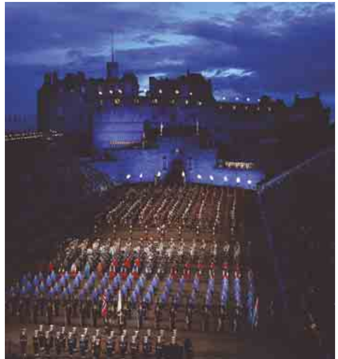
The Tattoo, with Craig Pryde at the mix position

Entrusted with mixing the show was Craig Pryde. He