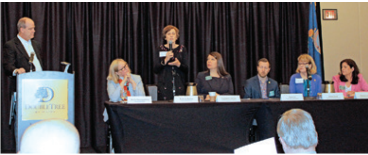
A panel of Johnson County legislators presented final updates on the 2018 Legislative Session at this year's final legislative breakfast presented last month by the Johnson County Public Policy Council.