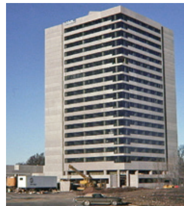
The DoubleTree Hotel came to Overland Park in 1982.

2008 – After years of resisting granting development subsidies, the City of Overland Park approved its first tax