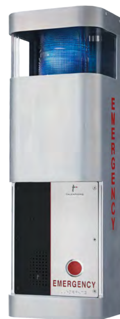
ETP-WM Wall Mount