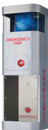
ETP-WM-TPK-IP66 Emergency Trip