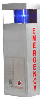
ETP-WME Economy Option