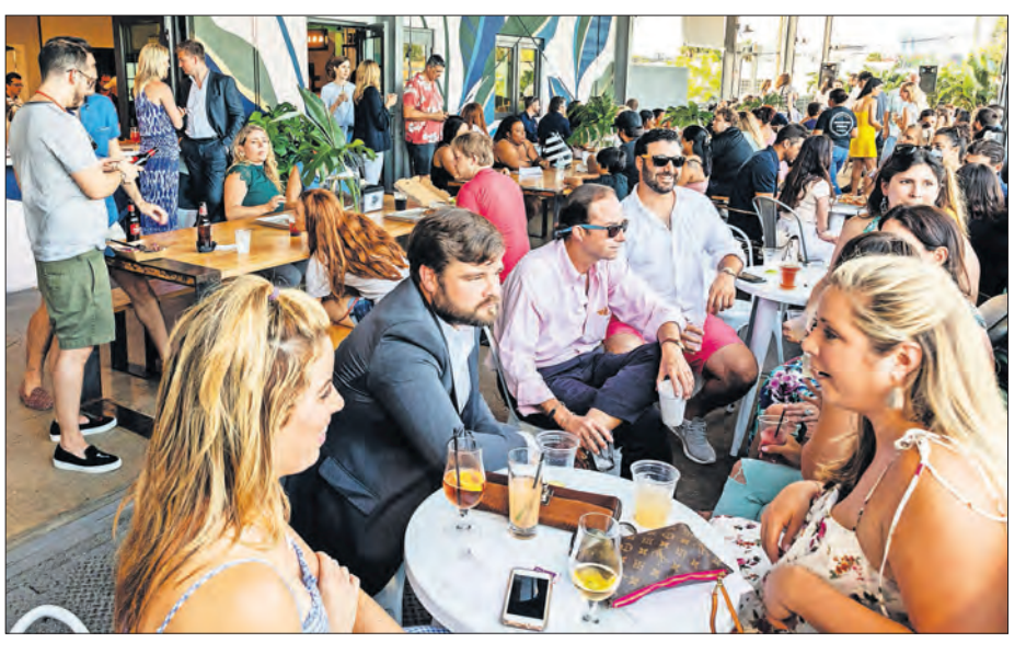
Participants enjoyed the museum's Friday night program "An evening of Art After Dark" on July 12.