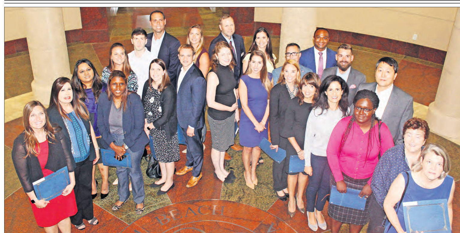
2019 graduates of Leadership West Palm Beach.