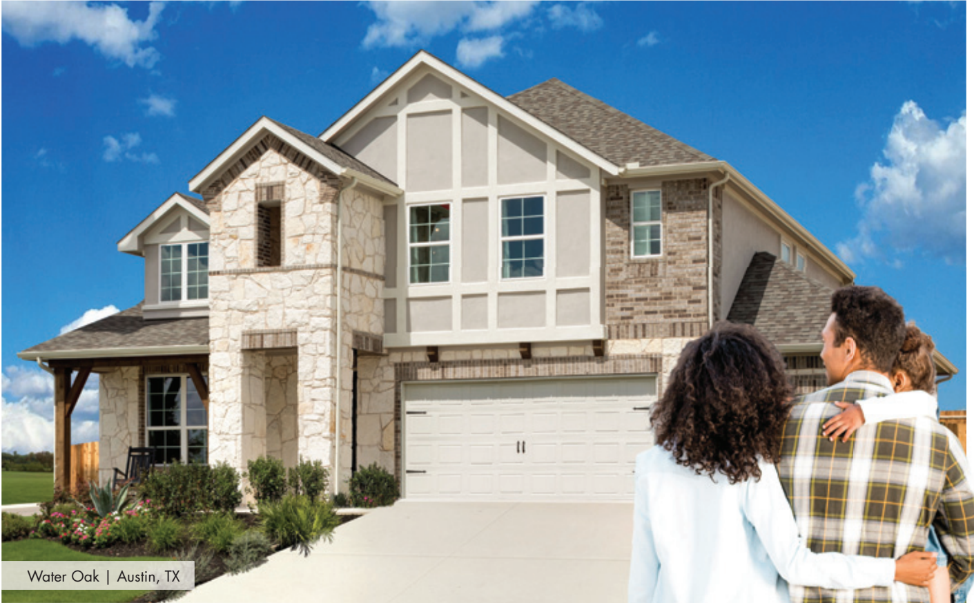
Water Oak | Austin, TX