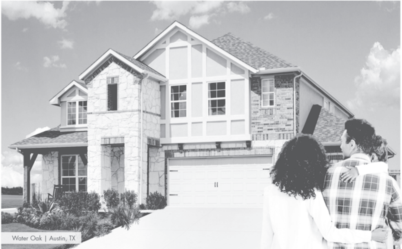
Water Oak | Austin, TX