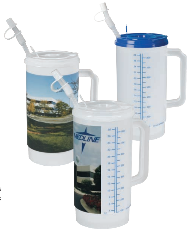
Carafe Color (main body of carafe)