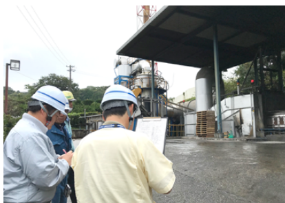
On-site confirmation at waste treatment subcontractor