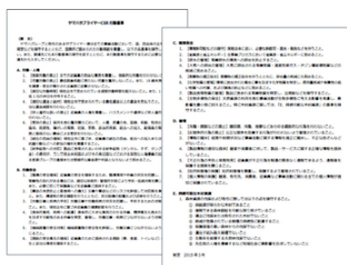
Yamaha Supplier CSR Code of Conduct