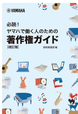
In-house copyright-related training tool