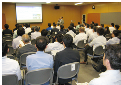
SDGs-theme lecture at training sessions for domestic suppliers (81 participants)

Confirmation of compliance status at waste treatment subcontractors: 35 companies (on-site confirmation at 25 companies)