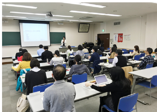
Internal copyright seminar

In addition, the Company has been revising the Copyright Guide, an in-house training tool related to copyrights, as needed to respond to new laws, regulations, and social trends. In Japan, the Company began distributing a revised guide in April 2019 based on the amendments to the Copyright Act implemented at the end of 2018 and beginning of 2019.