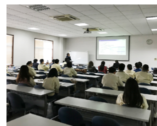
CSR procurement briefings (two in Indonesia, one in Malaysia, one in China)