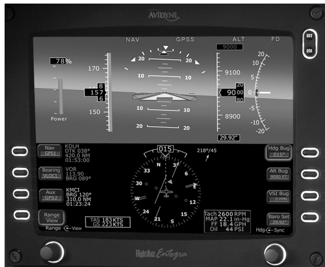
Figure 2-2. A typical primary flight display (PFD)

Electronic flight instrument systems integrate many individual instruments into a single presentation called a primary flight display (PFD). Flight instrument presentations on a PFD differ from conventional instrumentation not only in format, but sometimes in location as well. For example, the attitude indicator on the PFD is often larger than conventional round-dial presentations of an artificial horizon. Airspeed and altitude indications are presented on vertical tape displays that appear on the left and right sides of the primary flight display. The vertical speed indicator is depicted using conventional analog presentation. Turn coordination is shown using a segmented triangle near the top of the attitude indicator. The rate-of-turn indicator appears as a curved line display at the top of the heading/navigation instrument in the lower half of the PFD.