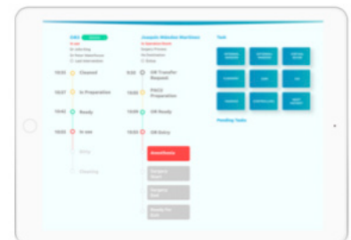
Figure 1: MySphera wearable Bluetooth tag (left) and real-time dashboard (right)

Staff are notified of the closest patient and next procedural step, and in turn log when the patient has moved to the next clinical phase of care. Out-of-order or incorrect steps prompt alerts, helping to avoid potential errors. Staff can enter updates in real-time, such as "in recovery," "in preparation," "equipment in use," and "equipment needs maintenance." This creates a fluid and orchestrated process to deliver and track care, improving patient outcomes and reducing the chances of error.