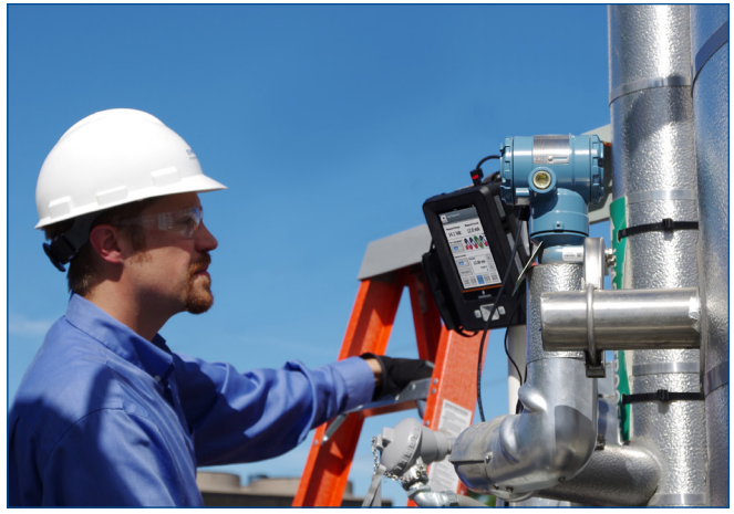
The magnetic hanger accessory allows you to attach the Trex unit to a pipe, freeing up your hands for other work.

AMS Inspection Rounds on AMS Trex digitizes information collected during inspection routes to drive operations and maintenance action. By delivering information to automation systems, personnel have accurate, real-time information that enables them to make better decisions. Graphical dashboards deliver insight into plant condition, helping prioritize action and highlighting critical safety issues.