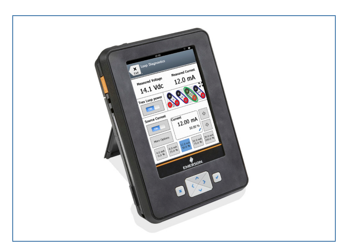
The rugged form factor is built for an industrial environment.