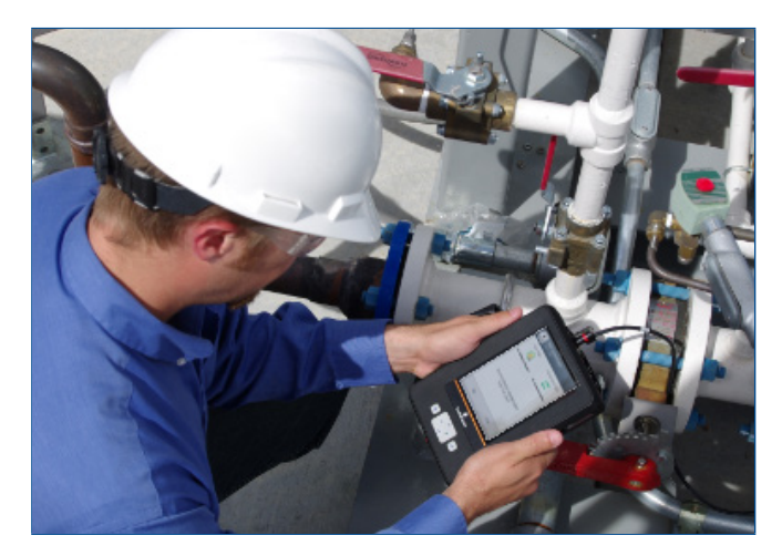
With the Trex communicator, you can do more in the field than ever before.