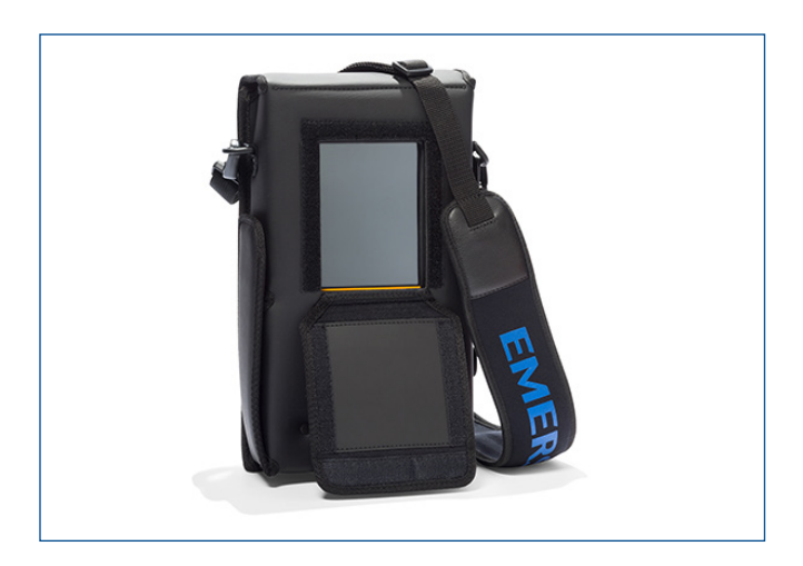
The useful carrying case protects your Trex unit in the field and provides storage options for accessory items.