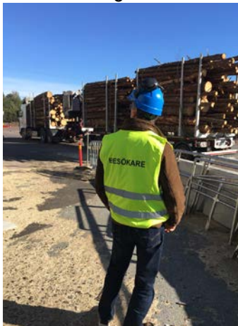
Wood arriving at the mill

Last month, we conducted our first field assessment in Europe and it was a very interesting and learning experience for me. We could see the whole cycle starting from 'thinning', allowing the remaining trees to keep up their growth rate, until 'clearcutting and replanting'. By visiting the forests, we got a better view of 'forest management' in practice. My 3M Sourcing colleague, Nourane, expressed our experience very well: " I will never look at a forest in the same way as I did before. " This on-the-ground activity was for sure a two-way flow of information and performance improvements. We are now working with this supplier to follow up on action items documented during our assessment.