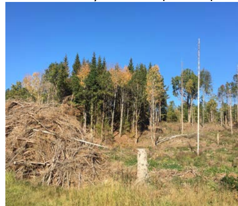
A recently cut and replanted plot