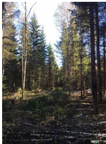
An example of thinning