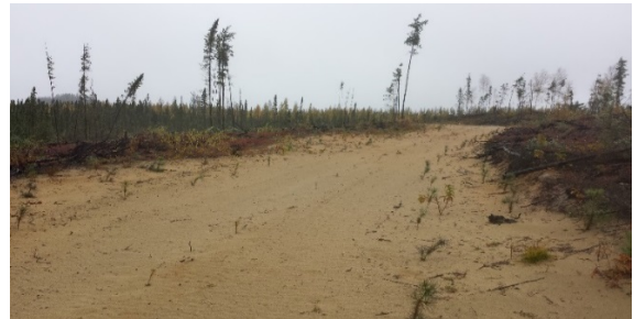
Seedlings growing on a logging road being restored to natural forest