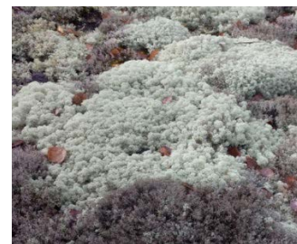
... and the lichen that grows in these areas (preferred food of woodland caribou)