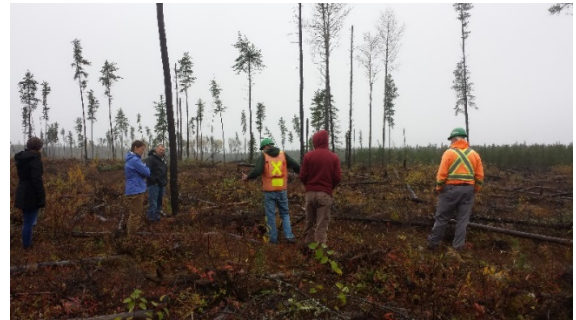
A recently harvested parcel