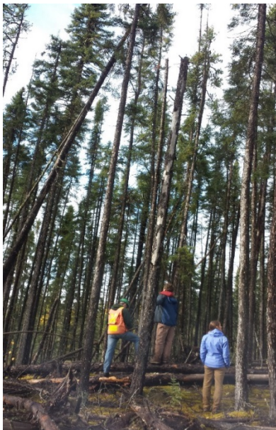
A set-aside area of 100+ year old black spruce trees...