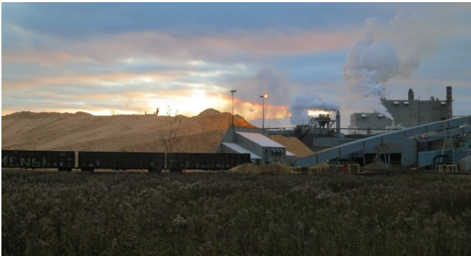
A view of the pulp mill, and part of their wood chip receiving area

The detailed on-site review of the mill and harvest sites provided us a first-hand education on the complex relationships among our suppliers, the pulp mill, the saw mills in the area, the forest tenures around the mill, the First Nations and other communities in and around the forests, activists and NGOs, and the Provincial and Federal governments. We inspected several harvest sites, in which we saw mosaic planning and harvesting in action (to protect caribou habitats), reforestation activities, logging road restoration, conservation of 100+ year old stands, and much more. We were honored to meet First Nation representatives in person, including a Chief of a local community and representatives from tribal councils.