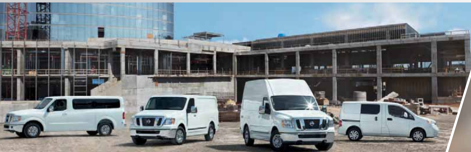
NV3500 ® HD Cargo High Roof with Endurance ® V8 shown. 4, 6

Going above and beyond is the Nissan way. After passing all of the brutal quality and durability testing, we're sure you'll have a van you can count on. To prove our confidence and our commitment, we are pleased to introduce America's Best Commercial Van Warranty, a bumper-to-bumper limited warranty for 5 years or 100,000 miles, whichever comes first. 13 And that means we've got your back, so you can keep moving forward. For more details of the limited warranty, please go to NissanCommercialVehicles.com or ask your Nissan Business Certified Dealer. 13