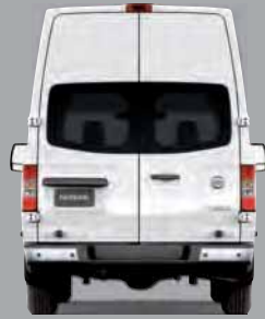
323 CU. FT. CARGO CAPACITY 6