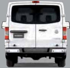
234 CU. FT. CARGO CAPACITY 6