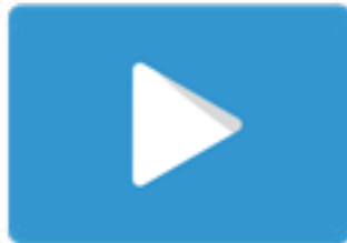
Garmin YouTube Videos