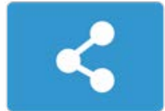
Garmin Aviation Facebook Page

Sign up for our newsletter for Garmin training notifications and other information.