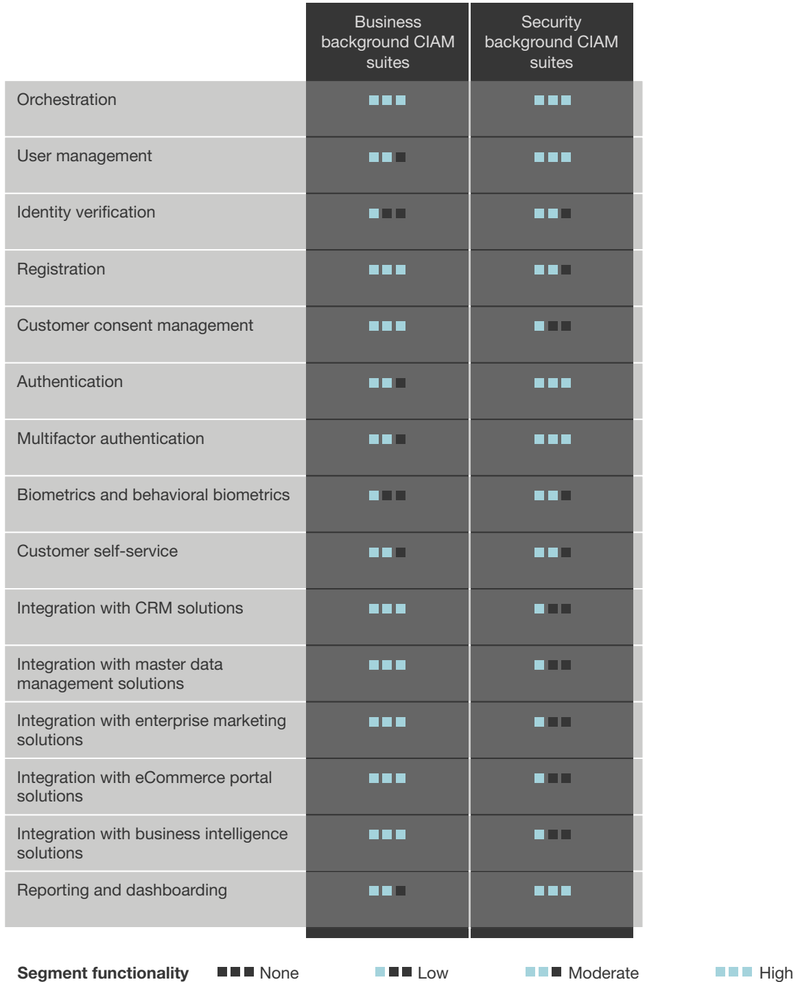
FIGURE 2 Now Tech Functionality Segments: Customer Identity And Access Management, Q2 2020

Forrester's Overview Of 24 CIAM Providers