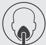
Full face mask

The masks featured in this brochure are examples of ResMed's full face range.