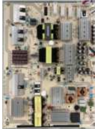
Power PWB (1pcs)