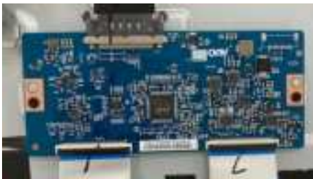
T-CON PWB (1pcs)