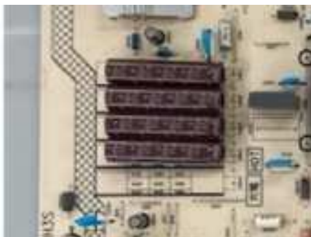
On Power PWB

Electrolyte Capacitors which diameter/height is larger than 25mm is installed on Power PWB. These capacitors can be removed by using nipper to cut the leads.