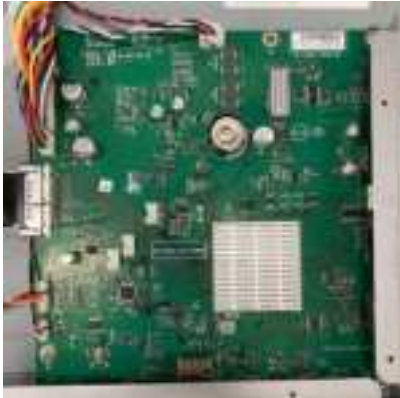
Main I/F PWB (1pcs)

All PWBs can be removed by screw driver.