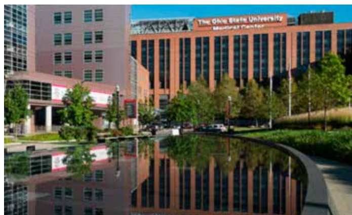
University Hospital, with more than 900 beds, is the flagship hospital of The Ohio State University Wexner Medical Center.

To fulfill goals set by the Code Blue/Early Response Team Committee, the medical center set in place a process that included prioritizing