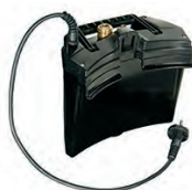
MV-912PB Pneumatic Box