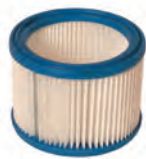
MV-412FE Filter Element