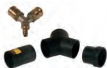
MV-412DOK Dual Operator Kit