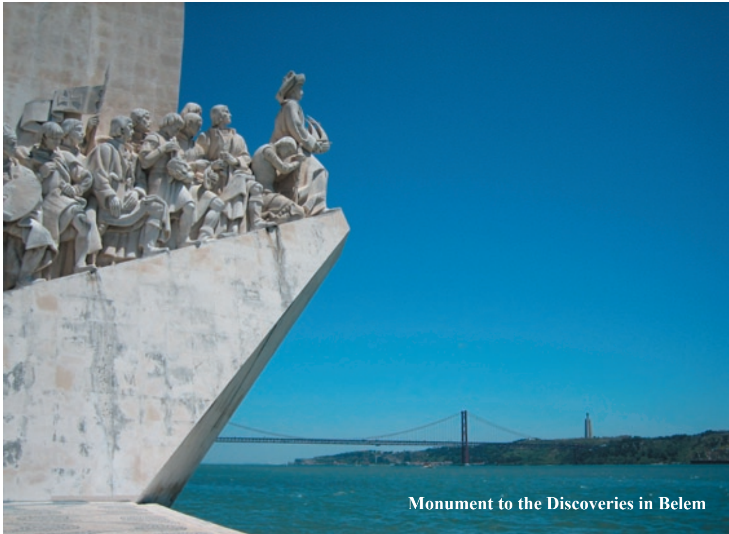
Monument to the Discoveries in Belem

The next day, several of us went to Oeiras beach, in the town where Bela lives. The beach was beautiful and there was a salt water pool area next to it. Portugal is blessed with an abundance of sun and water. Oeiras was on the way to Belem, which is part of the greater Lisbon area.