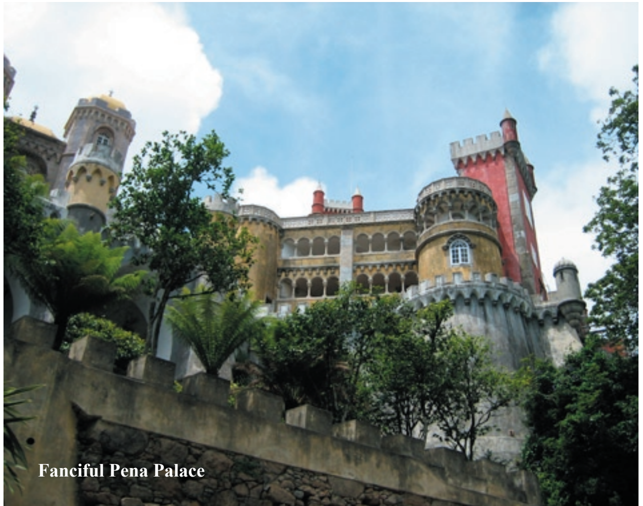
Fanciful Pena Palace

• The Lawrence Hotel, a five-star hotel near mine, is famous for being the oldest hotel