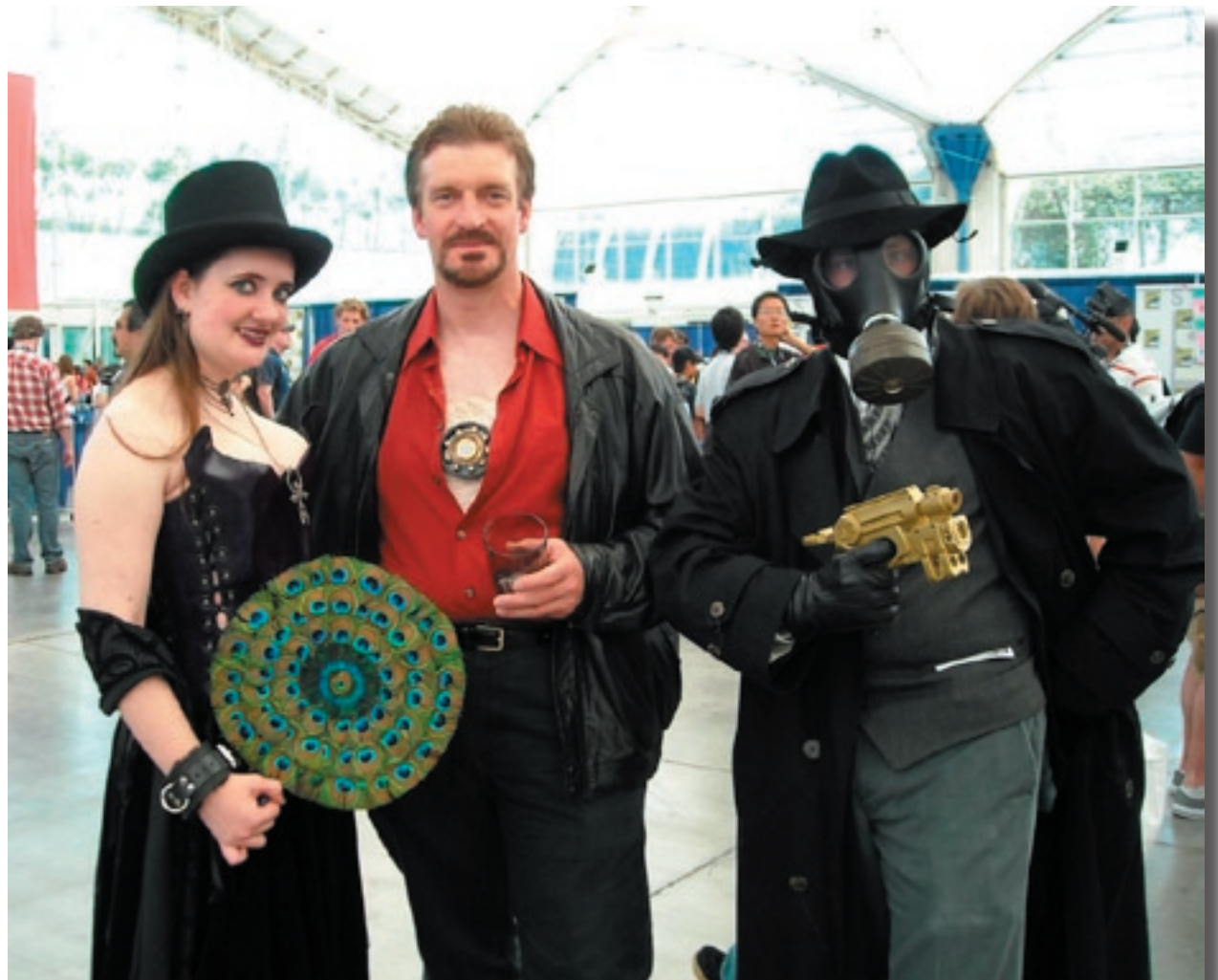
Bay Area costumers strut their stuff at Comic-Con in San Diego. More Comic-Con coverage starts on page 14.

Entertainment Weekly's photo gallery of the 20 Greatest Sci-Fi TV shows: http://www.ew.com/ew/gallery/0,,20224286,00.html . Not a bad list at all, but I would rate Doctor Who much higher, of course. (Thanks to Mikey for sending me this link just in time for the writing of this editorial.)