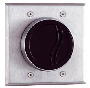
Saflok Quantum RCU/ECU