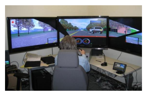
Figure 1. Driving simulator setup.

We examined two independent variables: SMS Reply Approach , consisting of voice search and dictation , and Driving Condition , consisting of no driving, easy driving and difficult driving . We included Driving Condition as a way of increasing cognitive demand (see next section). Overall, we conducted a 2 ( SMS Reply Approach ) × 3 ( Driving Condition ) repeated measures, within-