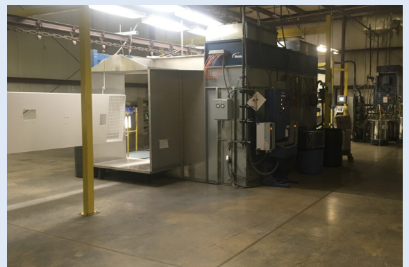
SMC Metal enjoy the benefits from Nordson's Lean Cell Fast Color Change Powder Coating System.