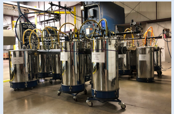
Each operator can select up to 28 different colors, on-demand