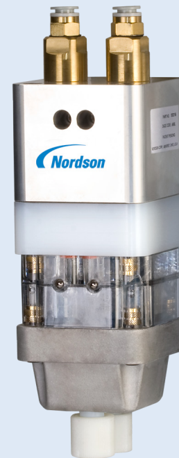
Nordson HDLV powder pump (2016 version, as installed at SMC - 2019 design now available).