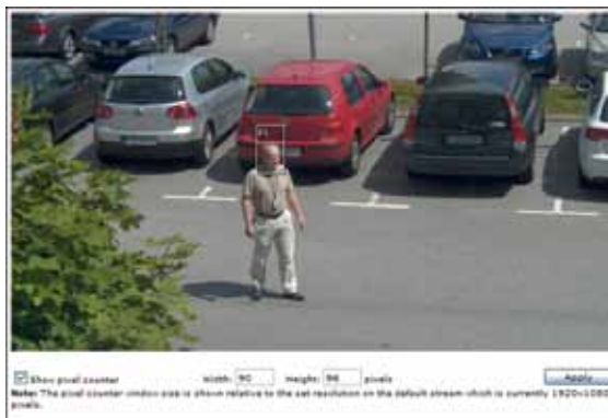
Pixel counter function in action

The pixel counter feature available in some Axis cameras lets you draw a rectangle on the screen around an area of interest. The camera will report the pixel dimensions of the rectangle. Using the pixel counter, you can easily verify that the camera installation fulfills resolution requirements.