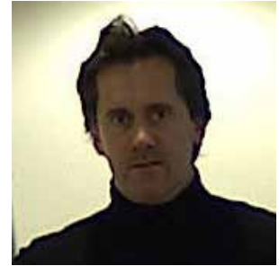
75 pixels 15 meters from camera 50 mm lens

At distances between 15–20 m, you will need a 50 mm lens to ensure that a face covers around 80 pixels. However, the examples clearly show that even at this resolution, positive identification is not guaranteed at the 100–150 lux illumination that is typical in an office corridor or subway station. Camera features such as wide dynamic range and sensors that perform well in low light situations can help, but the best results are obtained if these are combined with additional lightning and adjustment of camera positions to avoid backlit situations.