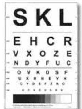
SKL targetSKL target

For more advanced calibration, a Rotakin device (rotating man) may be used, which simulates object motion and resulting image blur.