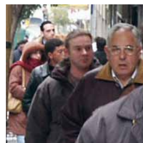
In this example, light is favorable both in intensity and direction. The camera is placed in level with passing people and the lens offers both focus and depth of field.

Stability can be challenging if the camera is mounted on a tall pole and you are using a zoom lens with a long focal length. Then, even small vibrations will translate to large movements in the resulting image.