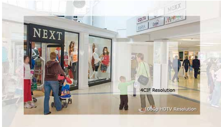
Cameras with higher resolution can cover larger areas

Since the maximum size of a scene covered at a given resolution only depends on the camera resolution, cameras with higher resolution can cover larger areas. For example, if your 7 m wide scene requires five cameras delivering 4CIF resolution, these can be replaced by two cameras at 1080p HDTV resolution (1920 x 1080 pixels). Also, a camera with higher resolution can be used to give a better overview, by covering a larger scene while maintaining the required linear resolution.