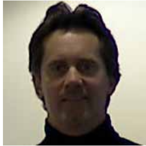
85 pixels 15 meters from camera 50 mm lens