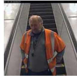
140% Face partly turned away from camera

Today, network video cameras offer a wide range of available resolutions. Using the percentage requirements is no longer practical, and pixels are now used when specifying resolution requirements. For a detailed discussion on resolution requirements for identification, recognition and detection, see the Perfect pixel count tutorial.