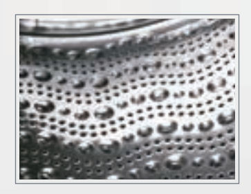
Vario Drum: Wave Droplet Design

Bosch has engineered a washing machine with VarioDrum. It is a specially designed drum which features a dual-sided system that provides thorough wash while protecting even the most delicate fabrics. As the drum spins in one direction, the flat side of the paddle gently cleans fine textiles and when it spins in the opposite direction, the steep side of the paddle ensures a deep clean with its wave-droplet design. Now you can wash your new and expensive clothes over and over again without worrying about diminishing their quality.