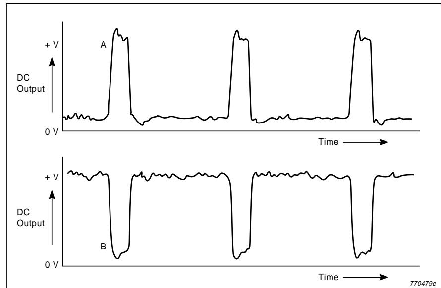
Fig. 1 Typical output signals from Photoelectric Tachometer Probe MM0012 projected at a rotating shaft. (A) from a white stripe on a black background, and (B) a black stripe on a white background

The signal amplitude generated by the MM0012 is a function of the difference in reflectivity of the contrasting surfaces passing the field of view, the distance to the reflecting surface, and the degree of light dispersion from curved surfaces.