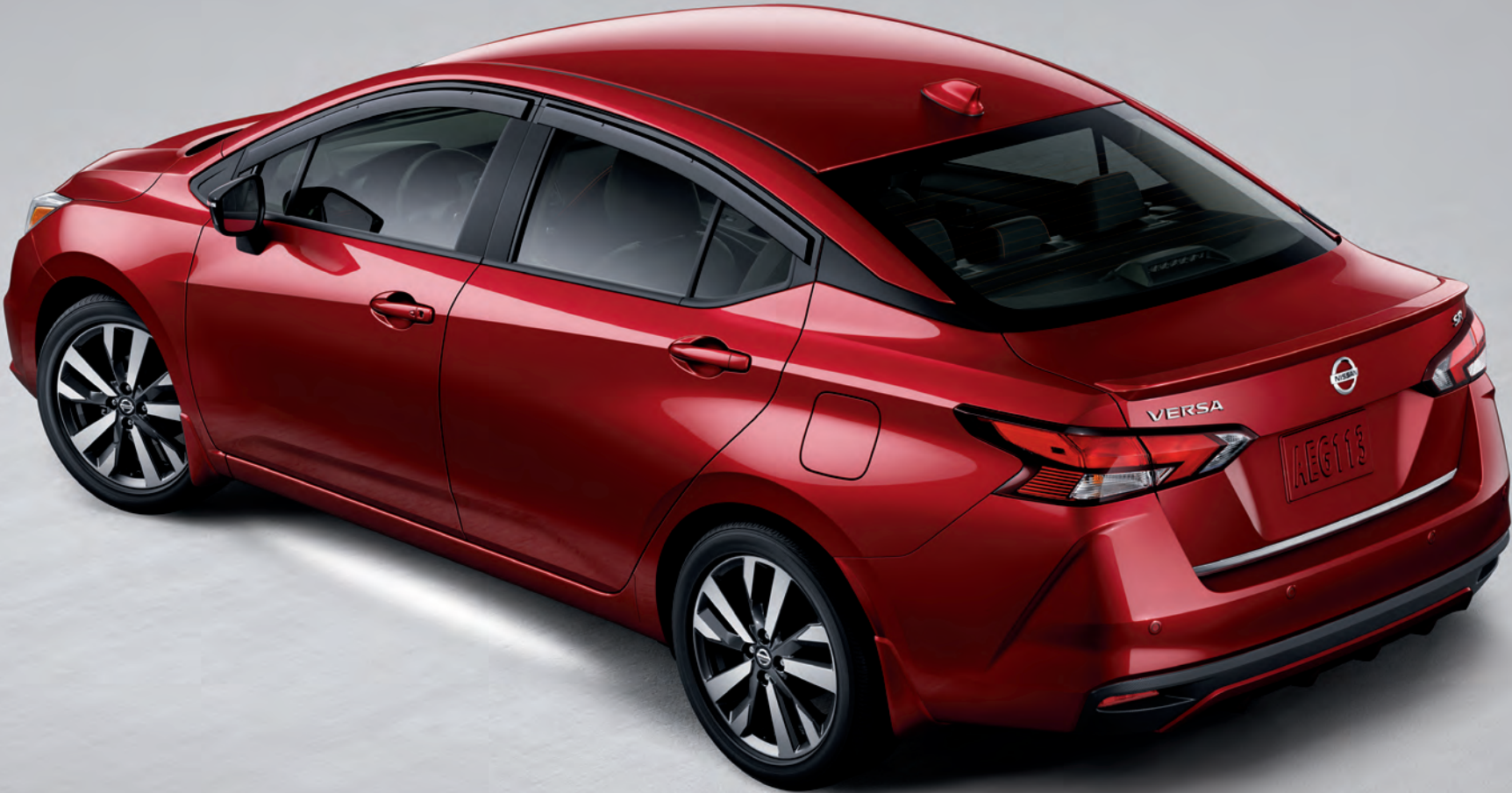
Nissan Versa® SR shown in Scarlet Ember with Chrome Trunk Accent, Exterior Ground Lighting, Side-Window Deflectors, Rear Spoiler (standard on SR), and Splash Guards.

Every Genuine Nissan Accessory is custom-fit, custom-designed and durability-tested. Each one is backed by Nissan's 3-year/60,000-km (whichever occurs first) limited warranty (if installed by dealer at the time of purchase), and can be financed when installed by dealer at time of purchase. Terms, conditions, and exclusions apply. See your Warranty Information Booklet for complete details.