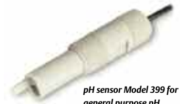
pH sensor Model 399 for general purpose pH measurements.

Final effluent monitoring plays an important role in wastewater treatment plants and is required for compliance monitoring, reporting to regulatory agencies, protection of wetlands, and it provides an indication of overall plant performance. Continuous online measurements of plant effluent can include pH, total suspended solids, ORP, and conductivity.