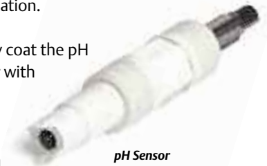
pH Sensor Model 396P requires minimal maintenance.

Since lime will gradually coat the pH sensor surface, a sensor with TU PH ® Reference Technology such as Model 396P includes a large reference junction for minimal maintenance requirements.