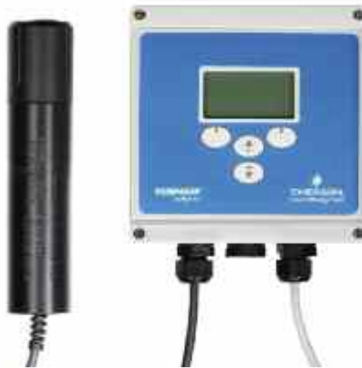
Sensor and Analyzer Model RDO for dissolved oxygen monitoring

Bio-slimes produced by the microorganisms coat the sensors, requiring constant cleaning and maintenance on a weekly and sometimes daily basis. With regular cleaning, the Model RDO sensor is less affected by fouling than membrane-covered polarographic sensors.