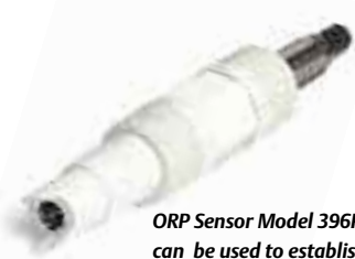
ORP Sensor Model 396P can be used to establish the ORP starting point.

In many areas, local or national agencies regulate the amount of chlorine allowed in the final plant effluent before being discharged into lakes, rivers, or the ocean. This requires dechlorination, which removes the free and combined chlorine residuals to reduce the toxicity after chlorination and before discharge. Limits are between 0.01 to 0.30 ppm of chlorine. Chlorine is closely regulated because even small amounts are harmful to aquatic organisms. Typically, plants are required to monitor their waste streams and report chlorine levels to a regulatory agency. Agencies can require either continuous or grab-sample testing.