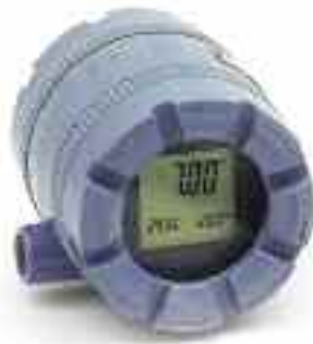
The Transmitter Model 5081 is ideal for harsh environments.

Analytical measurements in this hostile environment are ideally made using the Model 5081 Family Transmitter, which is both corrosion resistant (NEMA 4X) and suitable for