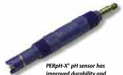
PERpH-X® pH sensor has improved durability and increased reference electrode stability

Denitrification reduces nitrates to nitrogen gas in the absence of oxygen. This reaction is also dependent on temperature, pH and occurs in the absence of oxygen.