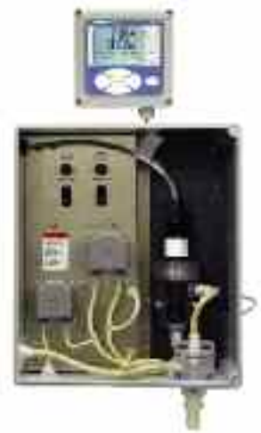
Model TCL, System for Total Chlorine Measurement

ORP sensors are also being used in disinfection, but the ORP reading does not indicate the chemical concentration, but instead indicates the oxidizing activity of water. For chlorination, the ORP starting point is highly variable, the control point may vary considerably, and changes in background wastewater composition will affect the ORP readings. For