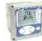
Model 1056 Analyzer