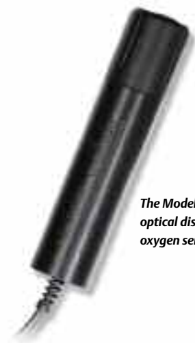
The Model RDO optical dissolved oxygen sensor

Power costs associated with the operation of the aeration process generally run from 30 to 60 percent of the total electrical power used by a typical wastewater treatment facility. Today, however, plant managers can equip their aeration basins with on-line analysis systems that provide continuous DO measurement. Furthermore, an automated aeration system can