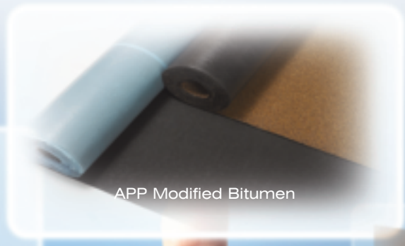
APP Modified Bitumen