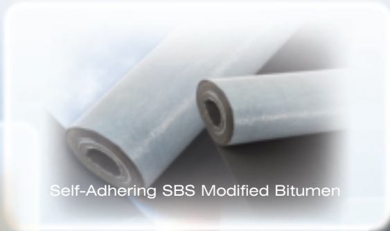
Self-Adhering SBS Modified Bitumen