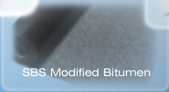
SBS Modified Bitumen