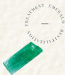
Special Raw Emerald