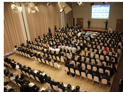
A scene from the Quality Control Circle World Conference

To thoroughly spread Panasonic’s approach to quality among its employees, the company holds training for all quality managers in each company, business division, and overseas subsidiary designed to teach employees about Panasonic quality twice each year (once per half). In November of each year, Panasonic also holds its Quality Control Circles World Conference to improve the quality control skills of on-site employees through the horizontal expansion of Quality Control (QC) activities, by which employees learn methods for solving problems in the workplace. At the 56th conference, held in fiscal 2019, 28 quality control circles were picked from a total of 4,565 groupwide circles to compete in a quality control grand prix.