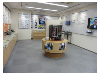
Product Safety Learning Square

To establish a culture in the workplace that makes product safety the top priority in manufacturing, Panasonic holds product safety training lectures to train product safety experts. To further ensure that this culture of prioritizing product safety reaches all group employees, Panasonic conducts product safety education, such as by providing employees with self-directed learning opportunities, including the Fundamentals of Product Safety e-learning program, and by holding Product Safety Forums, where employees can consider product safety-related issues through cases seen inside and outside the company.