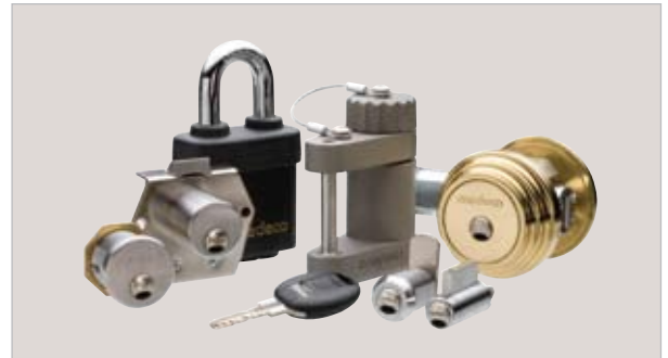
MEDECO eCylinders add advanced control to existing locks