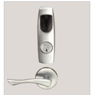
YALE Symphony has built-in card reader, door position switch, latchbolt monitor and request-to-exit