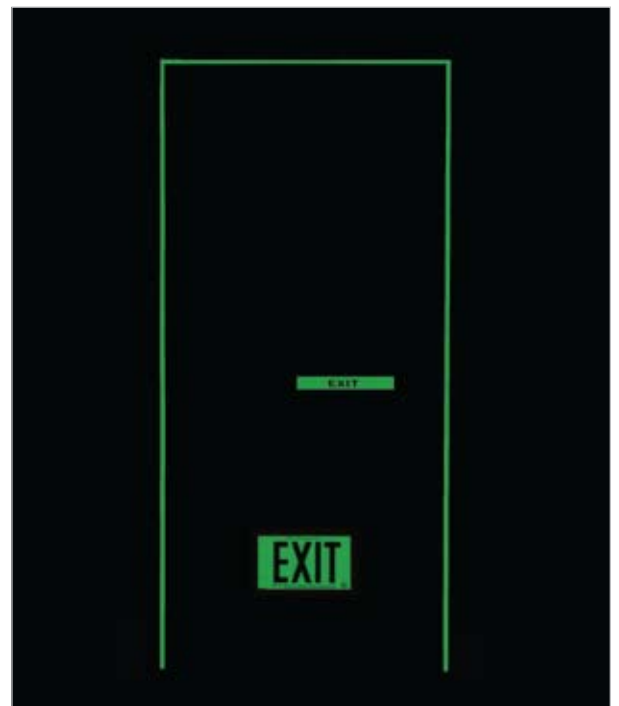
LumiLite can be part of a complete egress marking system that makes the opening easy to see in darkness