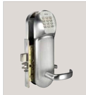
YALE eBoss controls access for 99 users