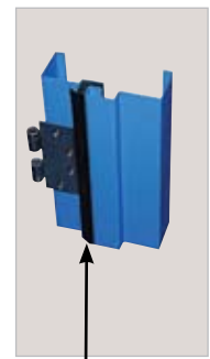
Thermal break frames include gasketing for energy efficiency