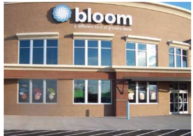
BESAM provides innovative solutions, flexible options and professional service