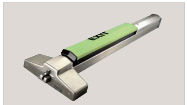
LumiLite™ from YALE requires no electrification, making it ideal for retrofit applications