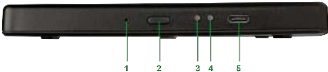
Fig. 1.3: Bottom Panel