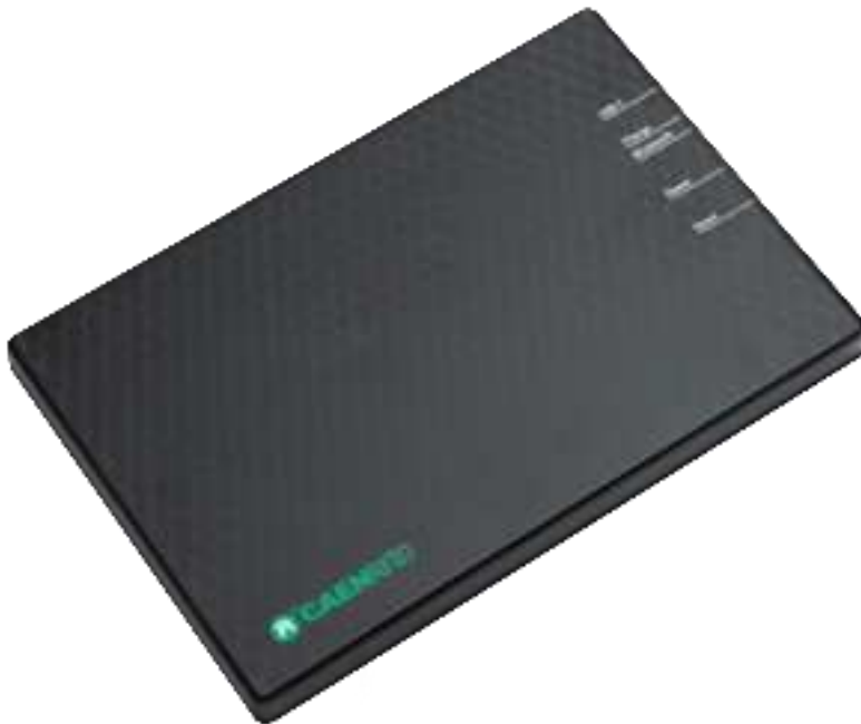
Fig. 1.1: trID R1210I Reader

The trID slim form factor permits to embed the reader in jewelry trays or to use it on a desk for document tracking or in healthcare environment to track surgery or dental tools.