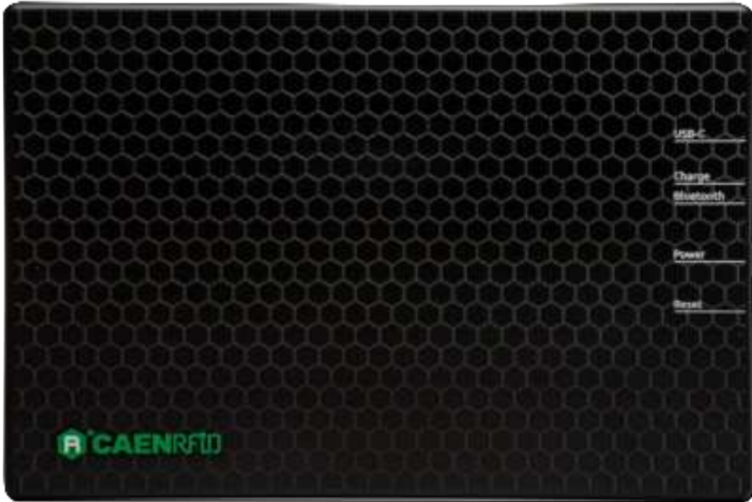
Fig. 1.2: Front Panel

The trID R1210I front panel houses the following buttons and icon (see figure below):