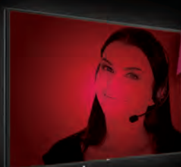
Current digital signage users say they have IMPROVED CUSTOMER SERVICE

Businesses expect digital signage to deliver deeper CUSTOMER ENGAGEMENT