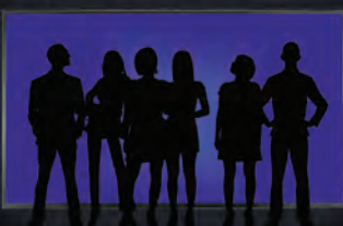
CUSTOMER ENGAGEMENT is the key benefit for deploying digital signage

How many digital signage screens/displays does your company currently use, across the entire enterprise?