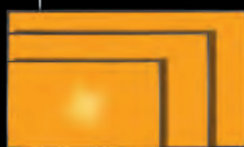
LARGER SCREEN SIZES & THINNER BEZELS