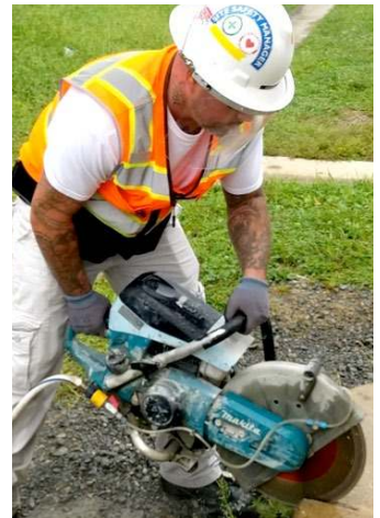
Applying water to the blade of a handheld power saw reduces the amount of dust created when cutting.

Under the Occupational Safety and Health Act of 1970, employers are responsible for providing safe and healthful workplaces for their employees. OSHA's role is to ensure these conditions for America's working men and women by setting and enforcing standards, and providing training, education and assistance. For more information, visit www.osha.gov or call OSHA at 1-800-321-OSHA (6742), TTY 1-877-889-5627.