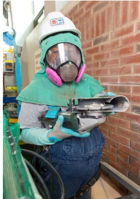
Worker is showing a handheld grinder equipped with shroud.

Ensure air flow is not impeded by the movements of employees during work, or by the opening or closing of doors and windows. Position the ventilation to move contaminated air away from the workers' breathing zones.