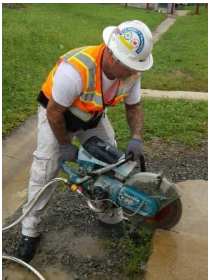
A construction worker using a handheld power saw with an integrated water delivery system.

Many handheld power saws come equipped with an integrated water delivery system designed to cool the blade by directing a continuous stream of water onto the blade where it wets the material being cut and reduces the amount of dust generated when cutting. Water can be supplied to the saw by either a pressurized container or by a constant water supply such as a hose connected to a faucet or construction site water supply. Water flow rates must be sufficient to minimize release of visible dust.