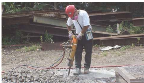
A worker chips concrete with a jackhammer using a water-spray attachment to control dust.