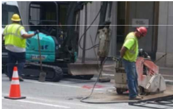
Worker using a walk-behind saw with an integrated water delivery system to cut asphalt roadway.

Wet cutting is an effective method to reduce exposure to silica dust when using walk-behind saws equipped with an integrated water delivery system that directs a continuous stream of water onto the blade where it wets the material being cut and reduces the amount of dust generated. These saws have built-in water tanks, or water is supplied to the saw from a source such as a hose connected to a faucet or portable tank. Water flow rates must be sufficient to minimize the release of visible dust.