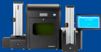
HID ELEMENT laser engraving system with single input hopper and output stacker