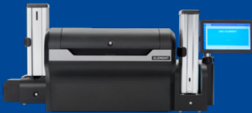
HID ELEMENT UV ink printing system with single input hopper and output stacker

With the registration and verification capabilities of HID ELEMENT's optional camera systems and supporting software integration, all applied visual data and features can be cross-checked for accuracy and precise placement — ensuring credentials are printed and/or engraved as intended and are consistent over large batch runs. Cards that do not pass verification can be sent to a secured reject bin. Individual camera systems are available for both the HID ELEMENT UV ink printing and laser engraving systems.