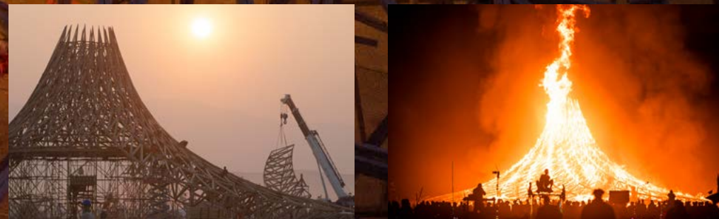
Background: Mamou-Mani's 2018 Galaxia project. Left inset: Construction of Galaxia . Right inset: Galaxia aflame.

For Galaxia , the designers translated their desire to minimize the timber required into terms a computer could easily understand: material weight. The generative design process allowed them to identify a design alternative that significantly reduced the amount of material burned. "The whole temple was like 60 tonnes [metric tons] of wood for 3,000 square meters, which is really almost nothing," Mamou-Mani said.