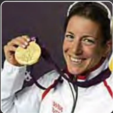
NICOLA SPIRIG BH Athlete and 2012 Olympic Gold Medalist, Women's Triathlon