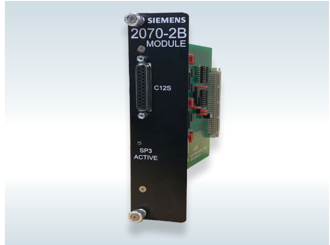
ATC Cabinet Module