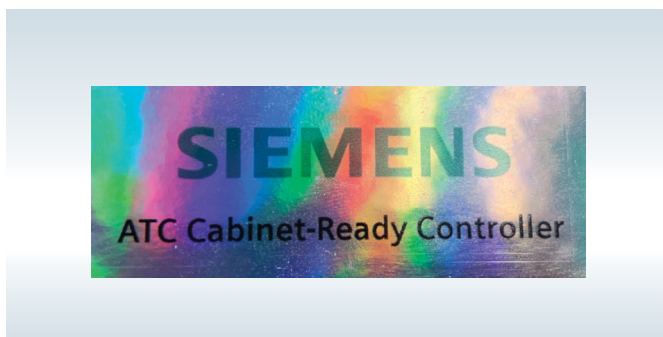
Product Label indicating presence of ATC Cabinet Compatible Backplane