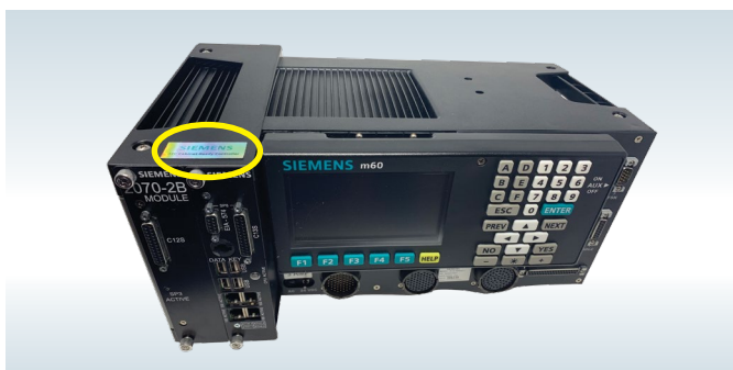
Product Label placement on all controllers containing the ATC Cabinet Compatible Backplane

The following Product Label will be included on all controllers which contain the ATC Cabinet Compatible Backplane. In order to connect any m60 series controller to an ATC Cabinet, an ATC Compatible Backplane and ATC Cabinet Module are needed.