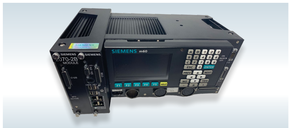
m60 ATC Cabinet-Ready Controller

The latest additions to the m60 series are the m60 ATC Cabinet-Ready controller and the m60 ATC LITE Cabinet-Ready controller. These controllers feature an ATC Cabinet compatible backplane which provides an innovative approach to those preferring to utilize an ATC shelf-mount cabinet. These new controllers will come with an "ATC Cabinet-Ready" product label to indicate that they come with an ATC Cabinet Compatible Backplane.