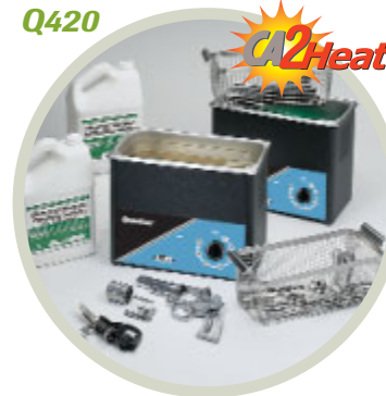
420 Set-Up #18635

Perfect for cleaning and lubricating multiple handguns simultaneously