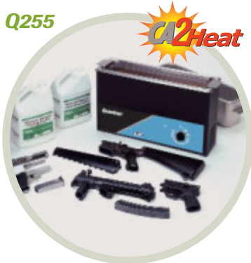
255 Set-Up #18639