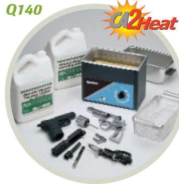
140 Set-Up #18631