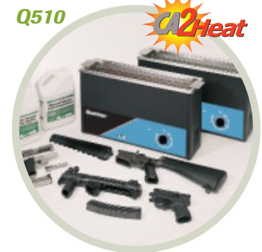
510 Set-Up #18647

Perfect for simultaneous cleaning and lubricating of multiple tactical weapons