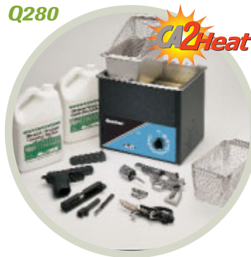
280 Set-Up #18637

Allows for simultaneous cleaning and lubricating of handguns