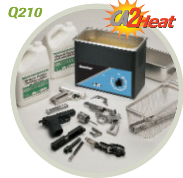
210 Set-Up #18633