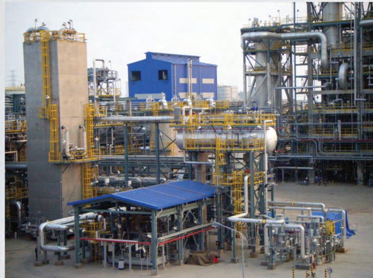
Chart Lifecycle, Inc.

Chart is a leader in cryogenic process design in the areas of Hydrodealkylation, purge gas processing and hydrogen - hydrocarbon separation systems where hydrogen recovery is essential. We offer design and fabrication of process systems for hydrogen recovery, purification, liquefaction and re-liquefaction.