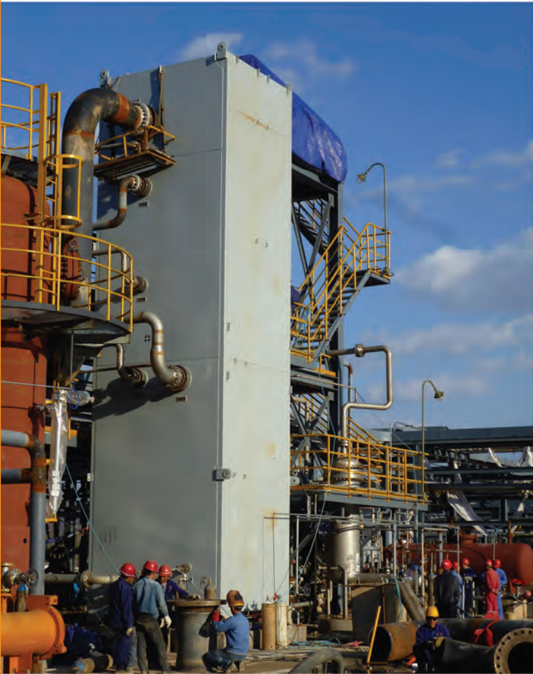
Chart is developing the LNG infra-structure right across the value chain, by building the plants that liquefy natural gas and the terminals for its off-loading, storage and distribution. We're also the company that engineer and provide the total solutions that are bringing LNG power to off-grid locations and displacing diesel and heavy oils for a range of high horsepower applications in industry and as a clean-burning, economic transport fuel for trucks, ships and rail.